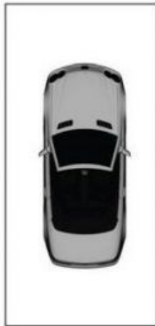
Secure Parking 2.5 x 5.3