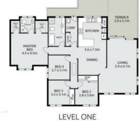
No warranty or guarantee is given that the plans shown herein represent the legal use or council approved use of the premises and are to be read as indicative only of the current visual space