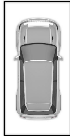
SECURITY CAR SPACE