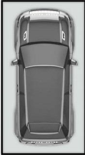
OFF STREET CAR SPACE