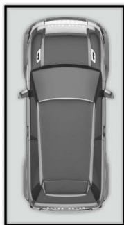
OFF STREET CAR SPACE