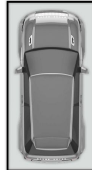
COVERED CAR SPACE 2.3 x 4.5m

This floorplan is for illustrative purposes only and should not be taken as an exact representation of the property. Measurements and aspect are approximate only and may not be to scale.