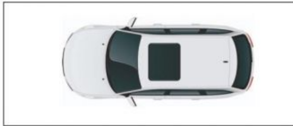
PARKING SPACE 15m 2