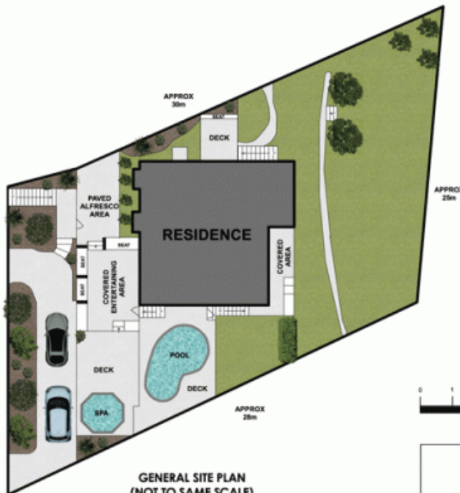
GENERAL SITE PLAN (NOT TO SAME SCALE)