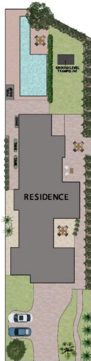
GENERAL SITE PLAN (NOT TO SAME SCALE)