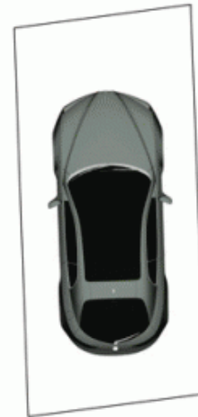
SINGLE PARKING SPACE 2.6X5.7