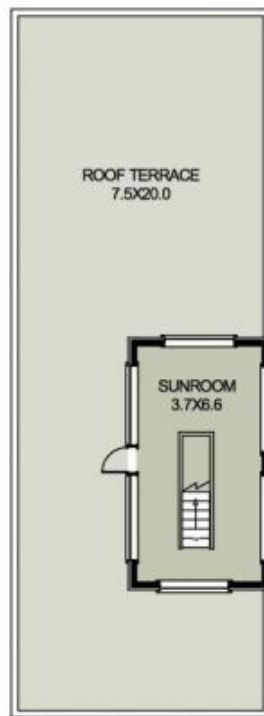
UNIT 1 ROOF LEVEL