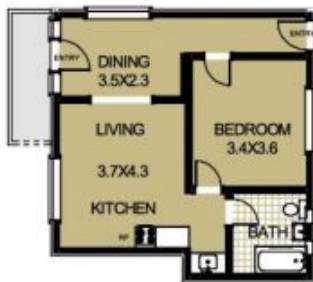
UNIT 4 1 BEDROOM UNIT LOWER LEVEL - RESIDENCE