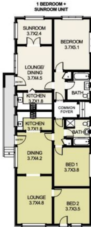
UNIT 3 2 BEDROOM UNIT MIDDLE LEVEL - RESIDENCES