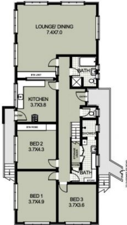
UNIT 1 3 BEDROOM UNIT UPPER LEVEL RESIDENCE