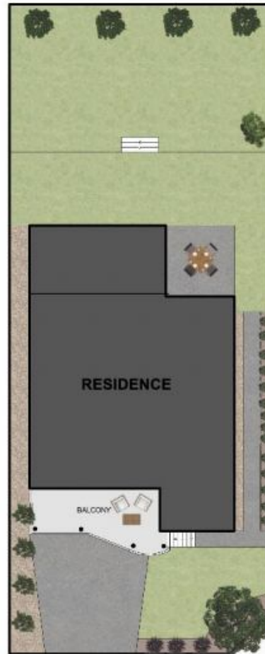
GENERAL SITE PLAN (NOT TO SAME SCALE)

APPROX AREA IN SQM GROUND FLOOR LIVING - 152.95 GARAGE - 37.97 LEVEL 1 - 153.47 BALCONY - 23.04 TOTAL - 367.43