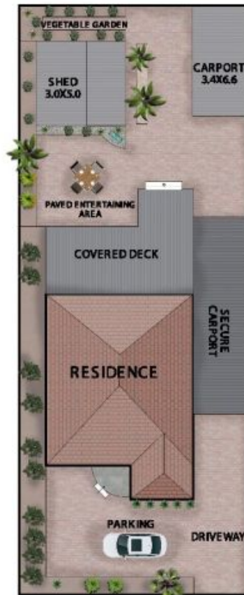
GENERAL SITE PLAN (NOT TO SAME SCALE)