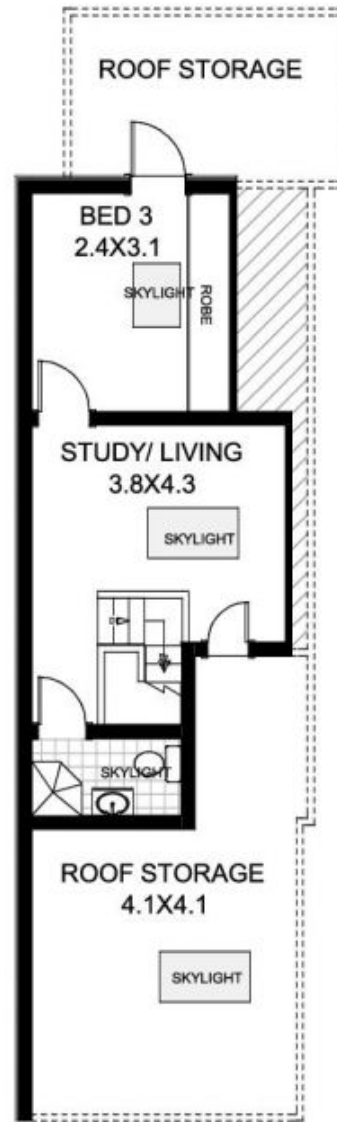
UPPER LEVEL - LOFT