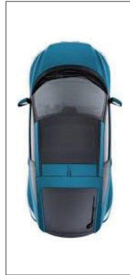
PARKING SPACE 2.6X5.7