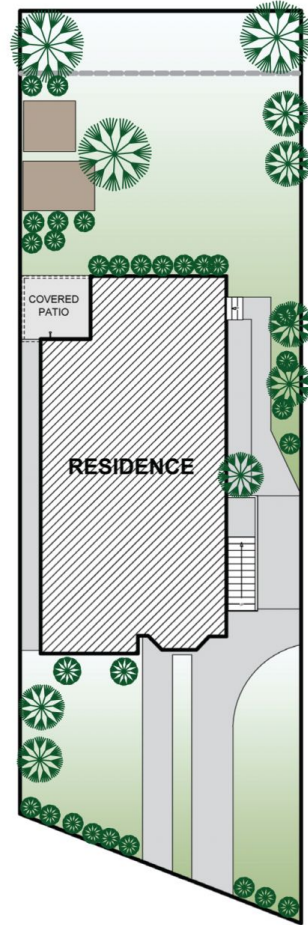
GENERAL SITE PLAN (NOT TO SAME SCALE)