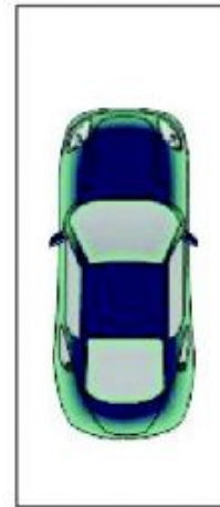
SECURE BASEMENT PARKING 2.6X6.1