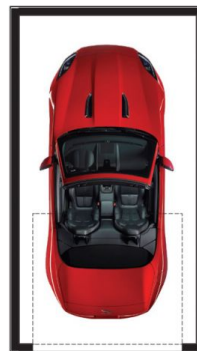
LOCK-UP GARAGE 2.9X5.4