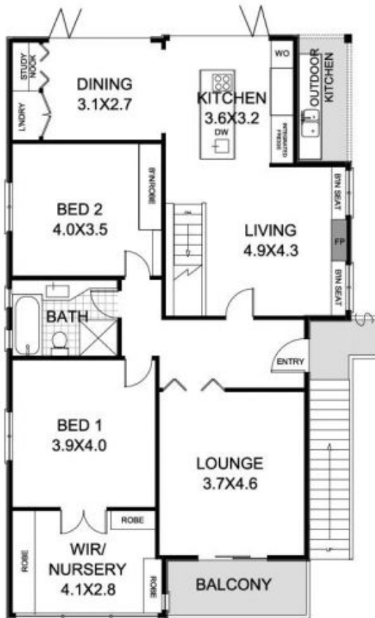
ENTRY LEVEL - MAIN LIVING