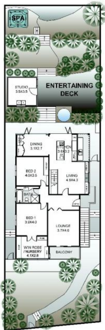
MAIN LIVING LEVEL AND GENERAL SITE PLAN (NOT TO SAME SCALE)