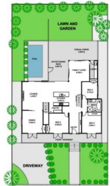
MAIN LIVING LEVEL AND GENERAL SITE PLAN (NOT TO SAME SCALE)