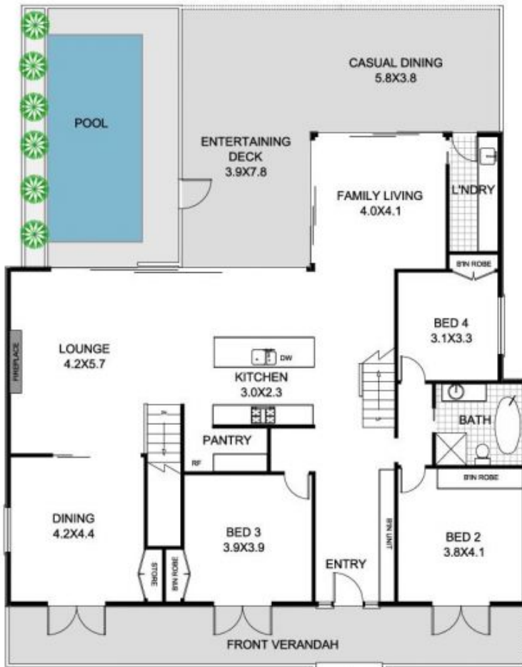
ENTRY LEVEL - MAIN LIVING