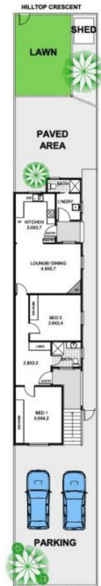
GENERAL SITE PLAN (NOT TO SAME SCALE)

Floor Plan Disclaimer: C.J-Floor Plans are for illustrative purposes and intended as a guide only. No representations or warranties of any nature whatsoever are given or intended and any person using this information should always rely on their own enquiries. General plan is an indication only of the layout of the land and may not be completely accurate. C.J-Floor Plans D10484108